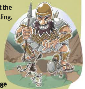
Bible story based on 1 Samuel 17

This was a day no-one would forget, when the courage of a shepherd boy saved a nation.