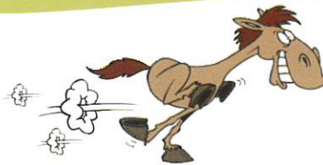
Bible story based on Matthew 7:24-27

Jesus said, “The man who built his house on rock is like someone who listens to my wise teaching and builds their life upon it. When storms and troubles come, they will stand firm.”